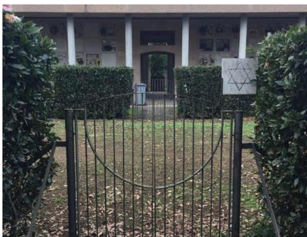
The entrance to the Jewish cemetery

A Jewish section of the municipal cemetery was dedicated in 2001, following the attack on the Twin