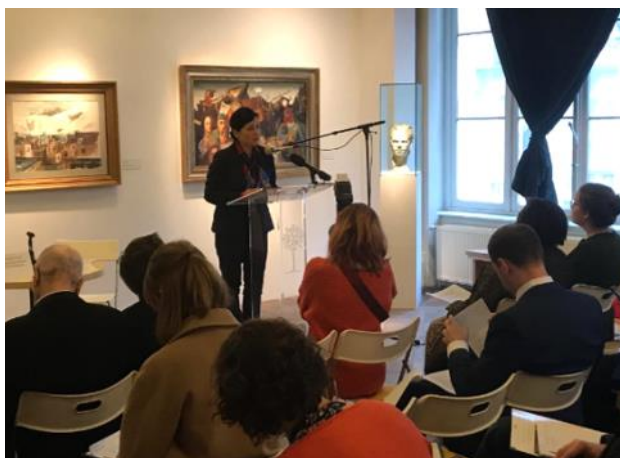
Commissioner Věra Jourová speaking in Brussels

"In fact, four in 10 Jews (once again) think about leaving Europe. When Jews have left Europe in the past, it has never been a good sign of the state of Europe. And I am – we are at the European Commission – determined to ensure a future for Jewish people on this continent; for the sake of the Jewish people and for the sake of Europe.