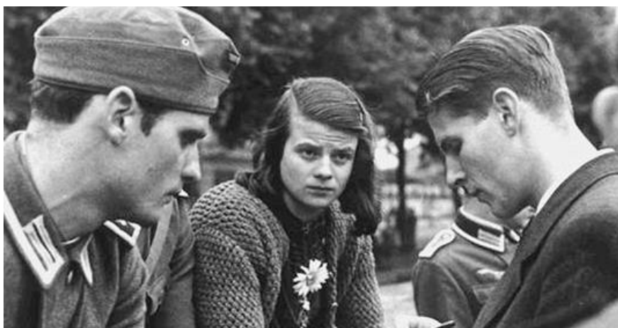
Hans Scholl, Sophie Scholl and Christoph Probst