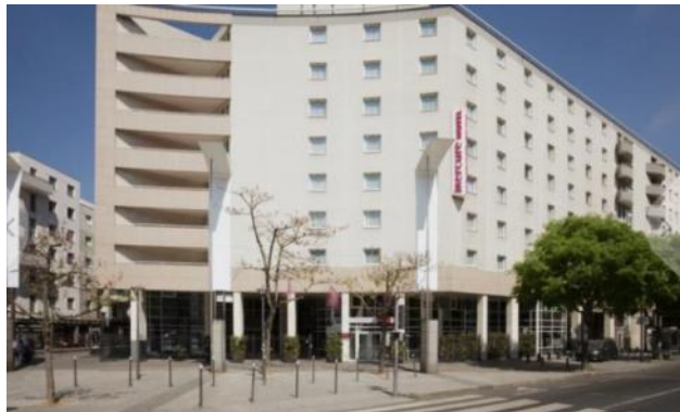
Mercure Charpennes Hotel