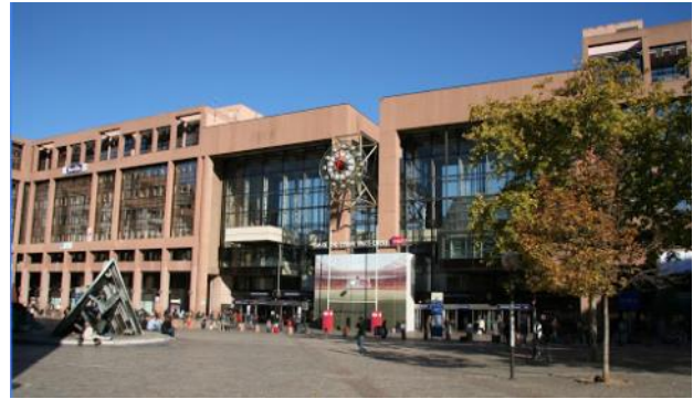
Gare de Lyon Part-Dieu

Eurostar via Paris or Lille for those coming from London or others coming by train, all arriving at the Lyon Part-Dieu station. Eurostar via Paris requires changing stations in Paris, and there are plenty of trains - or via Lille, same station, but there are fewer trains.