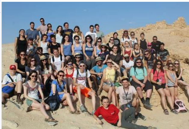
This summer 45 young adults took part in Reform and Liberal Judaism's UJIA Progressive Birthright

Mitzvah Day is November 27. Is your community involved?