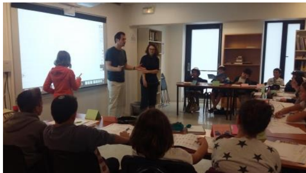
E-Talmud at MJLF, Paris

The modern-day challenge for teachers in any field is to capture the student's attention, stimulate his or her natural curiosity and find creative ways to transmit traditional values and knowledge. For Jewish educators, the question is compounded because students come from families that don't discuss pages of Mishnah over dinner, but are sufficiently motivated to sign up their children for Talmud Torah classes once a week.