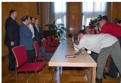
Abraham Geiger College press event