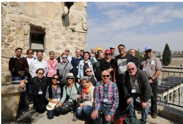
Beutel Leadership Seminar participants in Jerusalem

To nominate leadership from your congregation or find out how the Beutel seminar will transform your community, click here today .