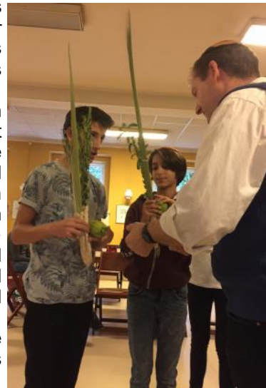
Sukkot at Shir Hatzafon