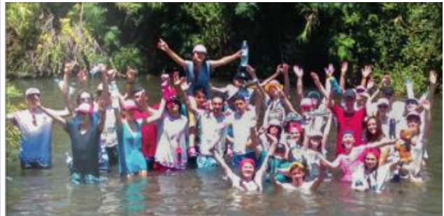
LJ Netzer youth enjoying their summer experience