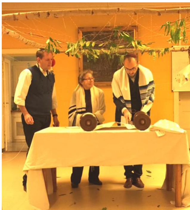
Shir Hatzafon, Progressive Judaism in Denmark, celebrates Simchat Torah in our sukkah