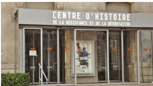
Resistance and Deportation History Centre