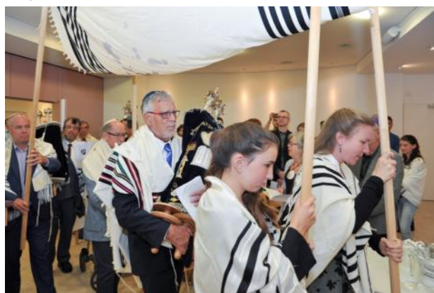
A celebration for the new Torah scroll in the Jewish Liberal Community (JLG) Or Chadasch, Zurich