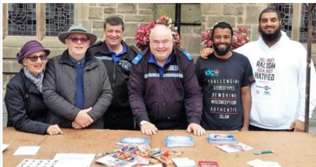
Durham Jews, Muslims and police together

On October 18 members of Durham's Jewish and Muslim communities came together to support police as part of National Hate Crime Awareness Week. Hundreds of pledges were signed by members of the public, of all ages, promising to tackle and prevent hate crimes.