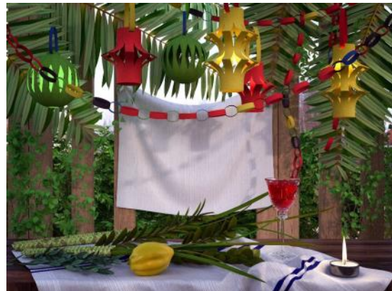
Bet Shalom's Sukkah

From Bet Shalom Barcelona we wish our sister communities in Europe: Shana tova umetuka!