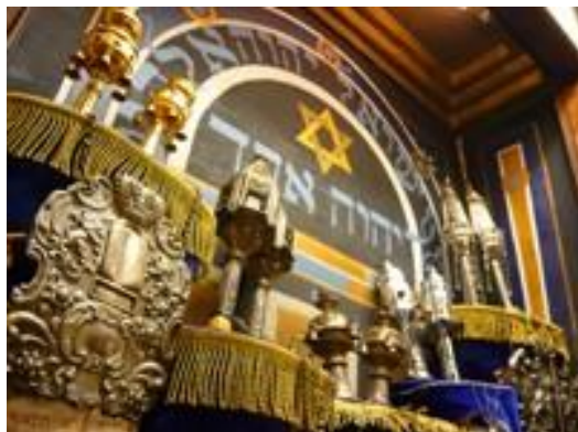
ULIF Copernic, Paris

Progressive congregations and Shabbat services can be found nearly everywhere during your travels. Click on a blue link to find a synagogue near your destination: Europe — Worldwide