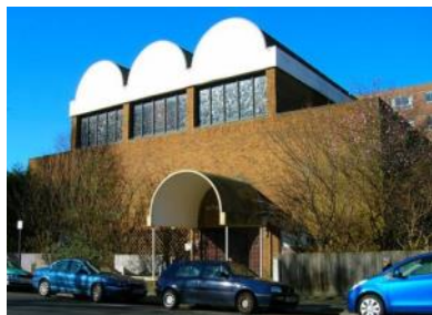
Brighton and Hove Synagogue Hove, UK