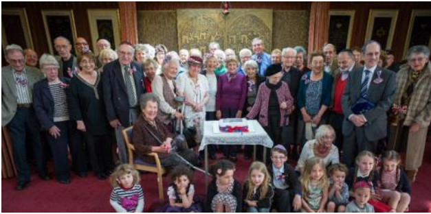
Mosaic community members who lived through the war years with some of the youngest generation

140 people attended a unique event on 9 th May at Mosaic Synagogue in Harrow to celebrate the 70 th anniversary of VE Day – the end of the 2nd World War in Europe.