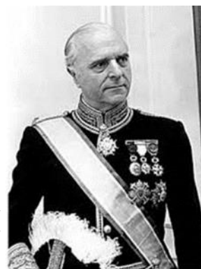
Ángel Sanz Briz