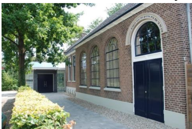
LJG Gelderland synagogue

This year the LJG (Liberaal Joodse Gemeente) Gelderland celebrates its 50th anniversary. The community is small, but strong. The 120 members live all over the province of Gelderland, and every fortnight there is a Shabbat morning service, attended by 40-50 people. The kehillah used to rent rooms where the services could take place. In 2001 there was an opportunity to buy and renovate a former synagogue that was sold after WWII. Since 2010 we have a beautifully renovated shul for all our services and other activities.