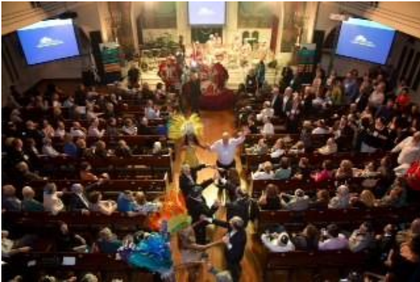
Connections 2015 combining simcha and samba

This column is being written within 24 hours of my return from Connections 2015, and to be honest it was one of the most memorable WUPJ conferences I have attended. Four days in Rio de Janeiro with more than 300 delegates from the four corners of the Earth made for an unforgettable gathering.