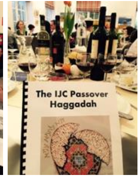
Children & the new Haggadah at the IJC Brussels